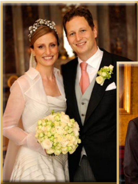
Their Imperial & Royal Highnesses The Prince & Princess of Prussia