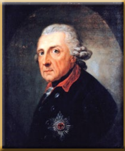
Frederick the Great in 1781 by Anton Graff.