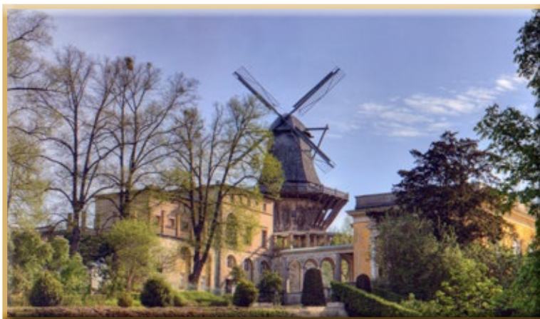
The Mill disturbed the King's sleep...