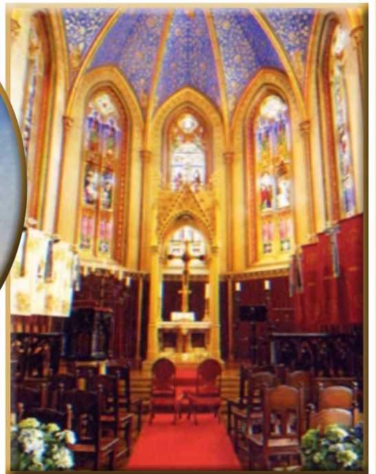
One of the Burg's Chapels

After breakfast we will join Their Royal Highnesses at the Hohenzollernburg for Mass followed by lunch and then we depart to the Stuttgart Airport.