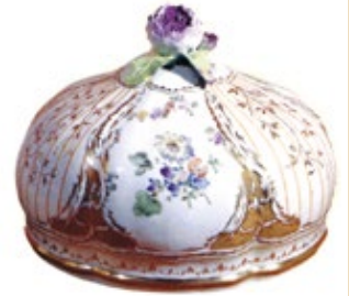
Keeping food warm in the 18th Century...