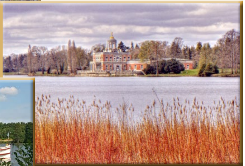
Marmor Palais. Just a sampling of what's in store...