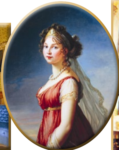
Queen Louise of Prussia-1801 by Madame Vigée-Le Brun