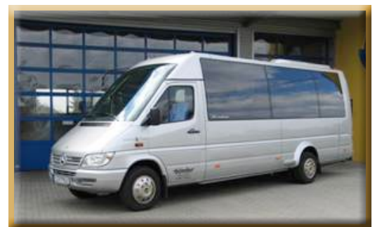
We will be driven each day in our "Petit Bus"