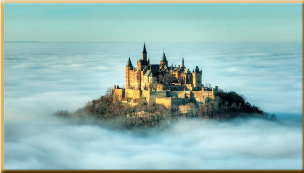
Not a dream! The Castle sits so high, it is often above the clouds...