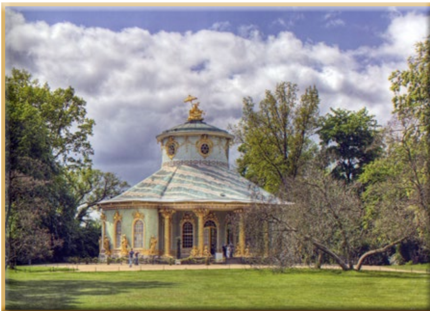
The Chinese Teahouse in the Park