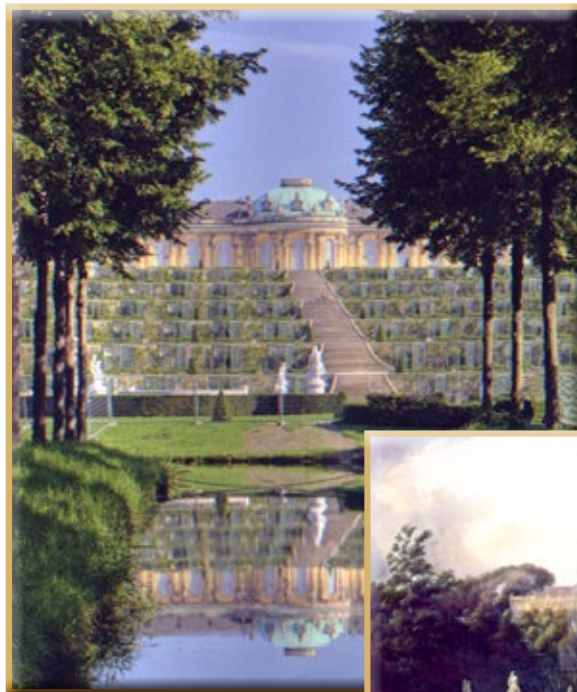
Sanssouci The King's Summer Residence from 1747 to 1786 Closed on Mondays, opened for us!