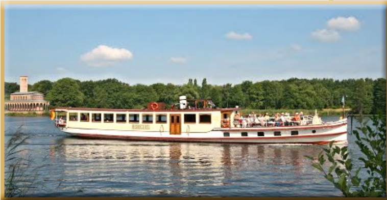
Lunch on "Friedericus Rex"