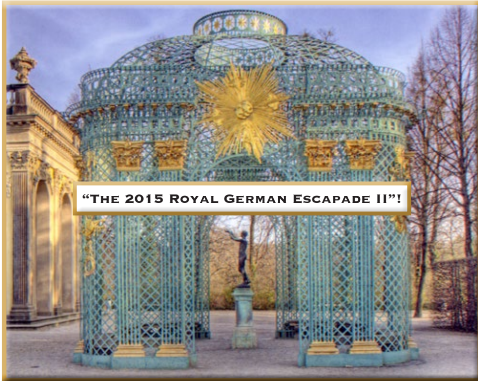
"THE 2015 ROYAL GERMAN ESCAPADE II"!

EMAIL: VERGIVINC@GMAIL.COM + WEBSITE: THEVERSAILLESFOUNDATION.COM