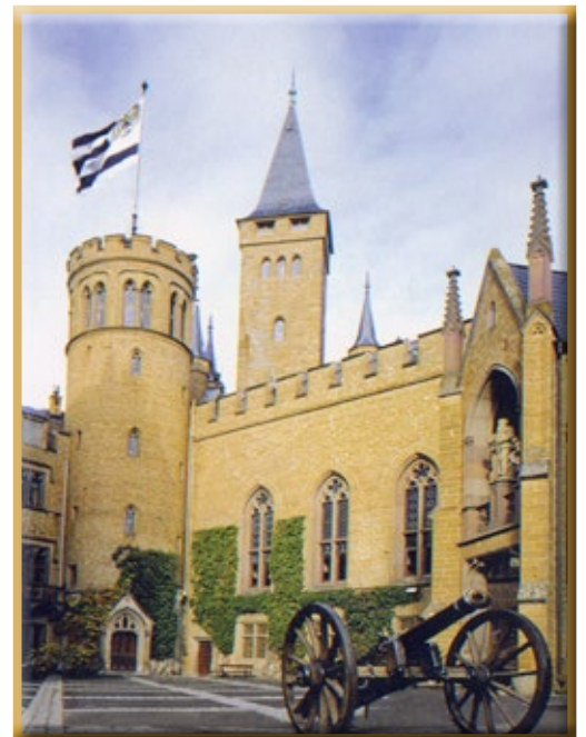
Their Castle: The Hohenzollernburg