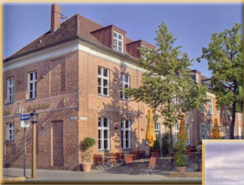
Lunch in Potsdam town