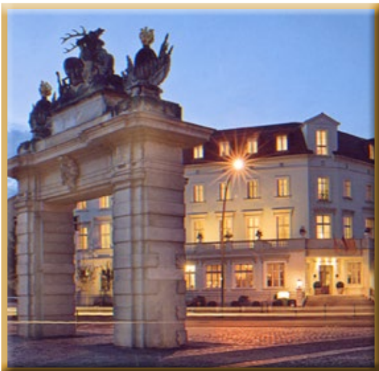
Our Hotel in Potsdam