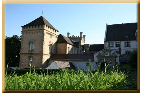
HOTEL SCHLOSS WEITENBURG, ENTRANCE VIEW

THURSDAY, AUGUST 30TH: Very early breakfast buffet in the dining room/terrace with a view high over the gorgeous valley.