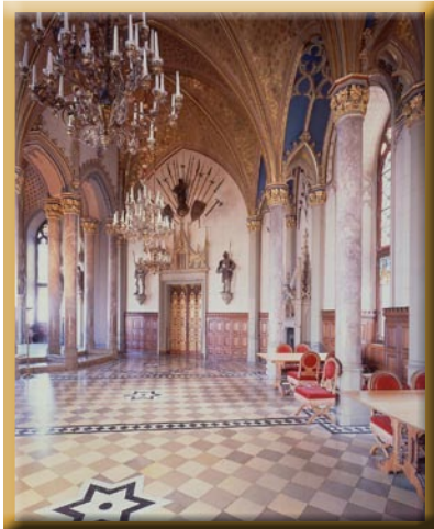
THE COURT'S HALL FOR THE CONCERT

10:00AM departure for tour of previous evening Hohenzollernburg with Their Imperial & Royal Highnesses followed by lunch, boarding school style, peppered in with the young Kira Foundation recipients who are preparing that evening's event.