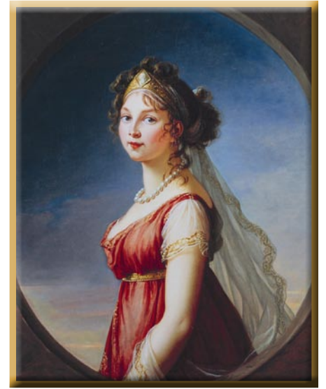
QUEEN LOUISE OF PRUSSIA-1801 BY MADAME VIGÉE LEBRUN

George Frederick of Prussia in the Blaue Salon of their Hohenzollernburg castle in which hangs the famous portrait of the lovely Queen Louise of Prussia painted by Marie Antoinette's favorite painter Madame Vigée Lebrun. Attire: Black Tie.