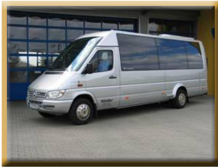
OUR "PETIT BUS"

After lunch: Unpack, take a nap and ready yourself for (time?) cocktails followed by dinner hosted by our Baron Max in his private apartment. Dress attire: Ladies- Elegant evening country attire; Men- Country summer weight jacket, Tie or Blazer.