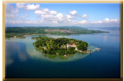
ISLAND OF MAINAU