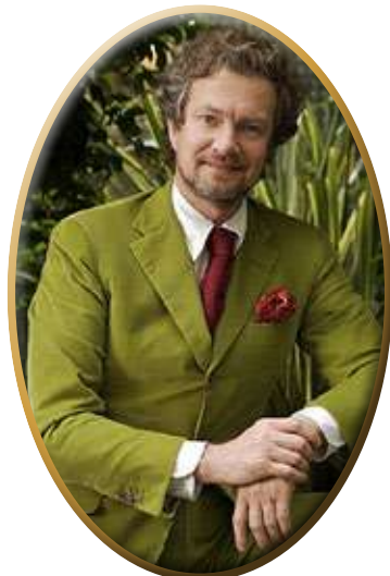
Prince Louis Albert de Broglie