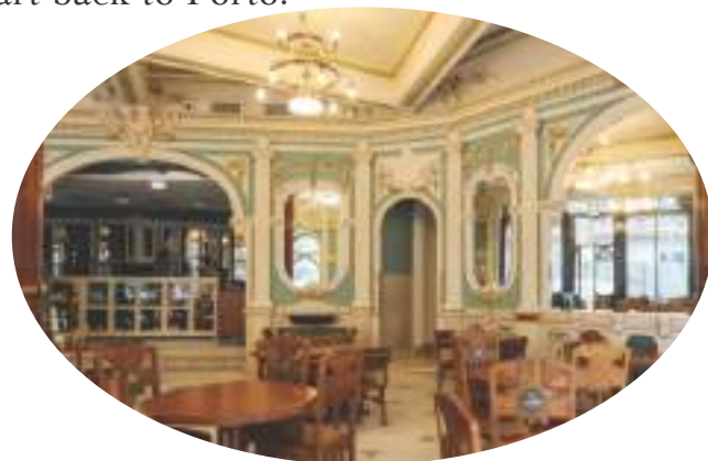
A light & late dinner around the corner at a very attractive Art Nouveau Café.